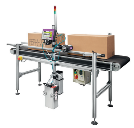
Change ink canister without stopping the printer

Ensures reliable operation even in a dusty environment and when splashed with water.